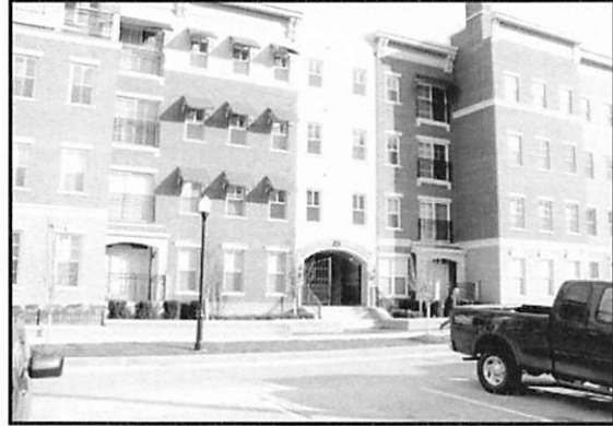
Figure 1405-03-C, D

Section 2. That existing Section 1405-03, “Specific Purposes of Multi-Family Subdistricts,” of the Cincinnati Municipal Code is hereby repealed.