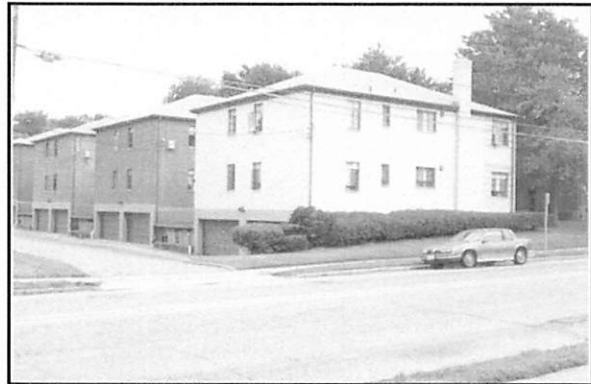
Figure 1405-03-A, B